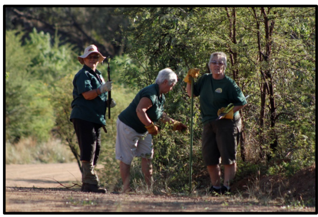
A few extreme gardening pics, taken by me in March