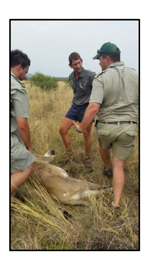
Some photographs taken during the re-capture of the lioness.