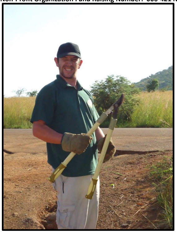
Armed and dangerous?