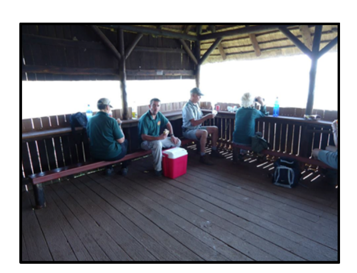
Breakfast at the hide