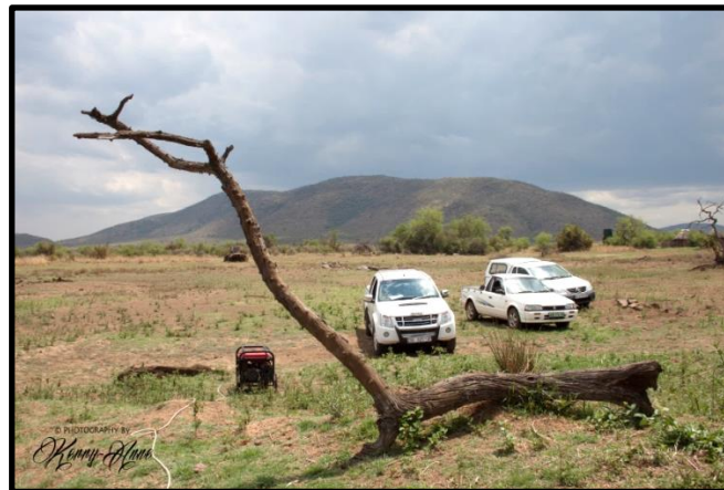
Had to do a bit of bundu-bashing to get there

Iron Age Site: The same story as before- we cut back, sprayed and put herbicide on the cut stems.