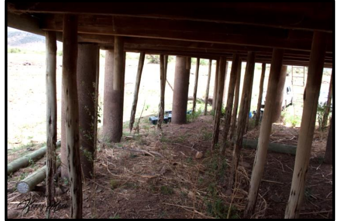
Shocking state of the supports under the hide