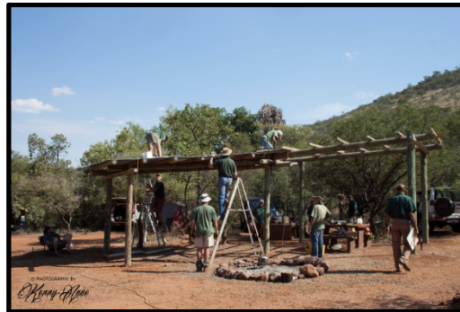
Gazebo building operations under way.

Project 2: Alien vegetation. We chopped out some Syringa trees and Lantana