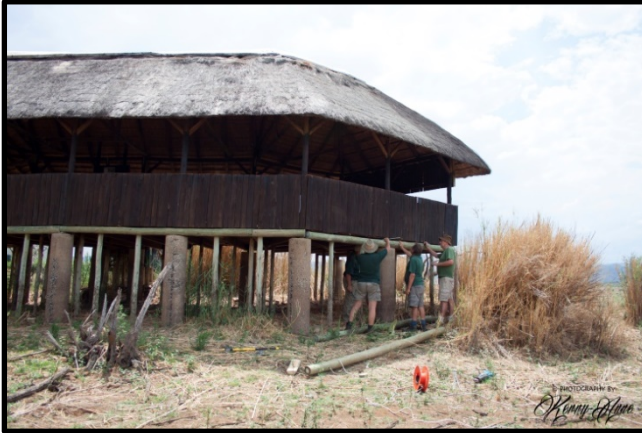
Hard at work