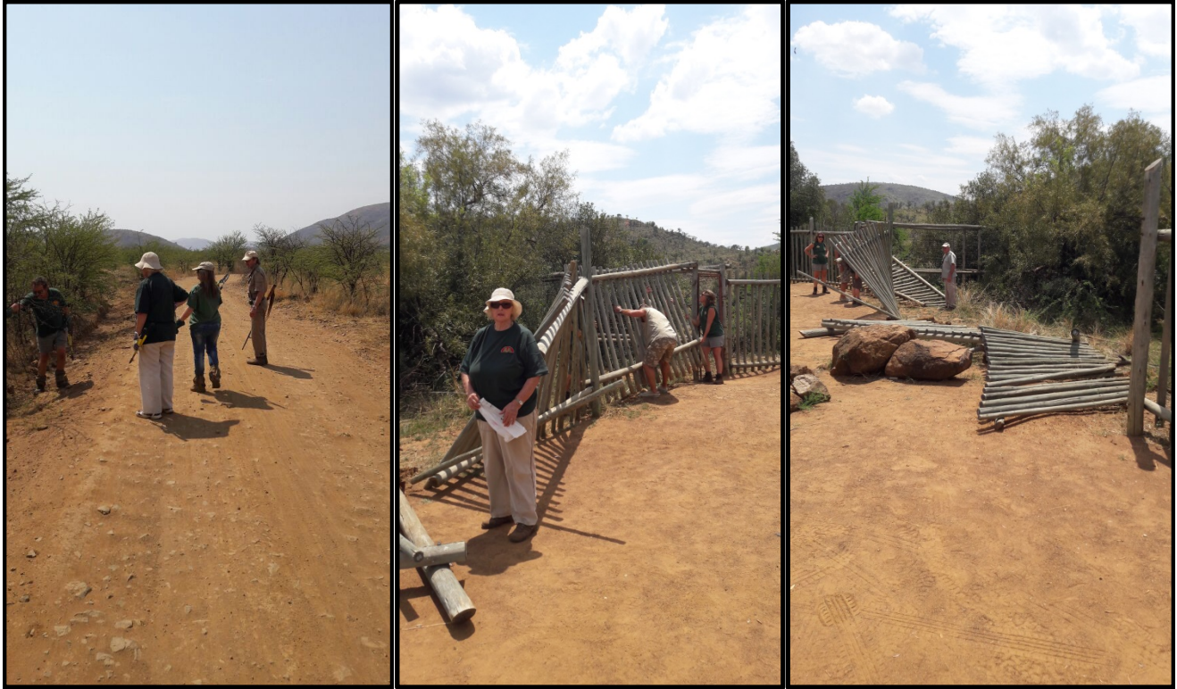
Road clearing and examination of the elephant damage at Bathlako.