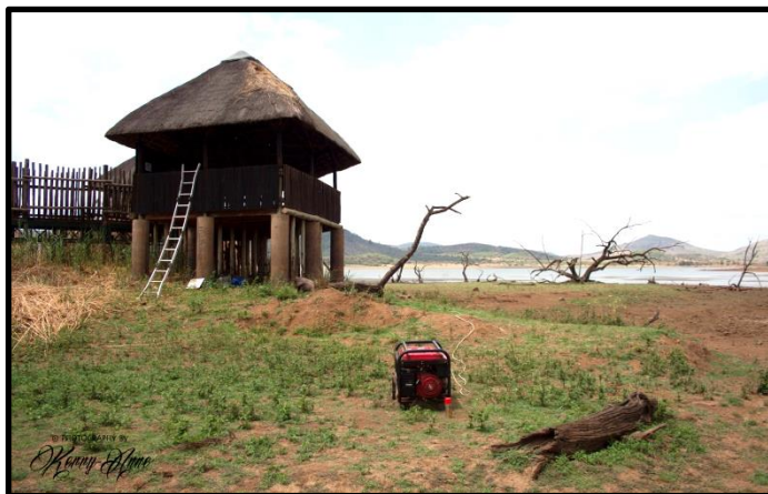
Thankfully there was lots of space between us and the hippos...

A few of my photographs, taken at the Mankwe Hide work party.